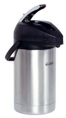
AIRPOT, 3.0L SST LA SINGLE PK