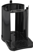
STAND ASSY, TF SERVER