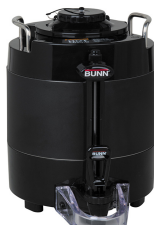
TF SERVER, 1G/3.8L MECH BLK NOBASE