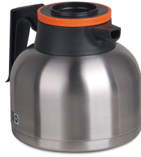
CARAFE, SST 1.9L SHRT ORN 12/