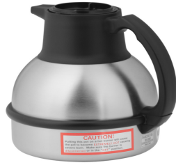
THERMAL CARAFE, BLK 1.9L 1PK