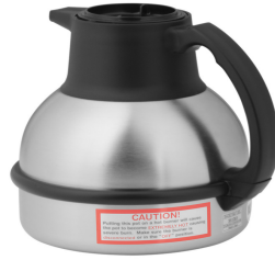
THERMAL CARAFE, ORN 1.9L 12PK