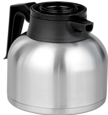
CARAFE, SST 1.9L SHRT BLK 12/