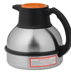
THERMAL CARAFE, ORN 1.9L 1PK