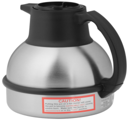
THERMAL CARAFE, BLK 1.9L 12PK