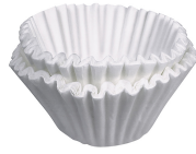
FILTERS,REGULAR1M 500/2 50/CL