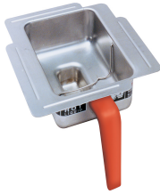
FUNNEL ASSY,SST-PP ORANGE HDL