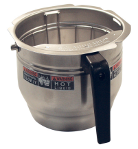
FUNNEL AY,W/DECAL GRT "C"7.12