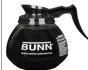
DECANTER,GLASS-BLK 12CUP 1PK