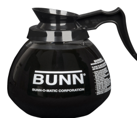
DECANTER,GLASS-BLK 12C 24/CS