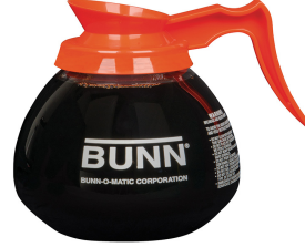
DECANTER, GLASS-ORN 12C 3/CS