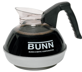
EASY POUR,(BLK) 2/CS