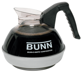
EASY POUR,(BLK) 6/CS