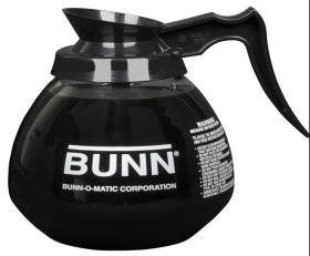
DECANTER, GLASS-BLK 12C 3/CS