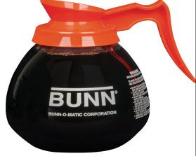
DECANTER, GLASS-ORN 12C 24/CS