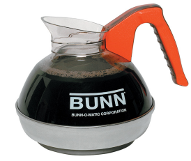
EASY POUR,(ORN) 6/CS