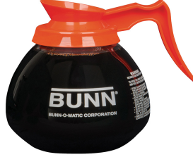
DECANTER, GLASS- ORN 12 CUP 1PK